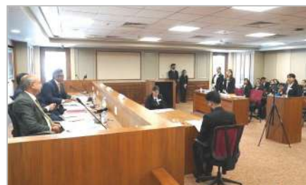
1st NMIMS National Moot Court organized at Chandigarh campus in 2025